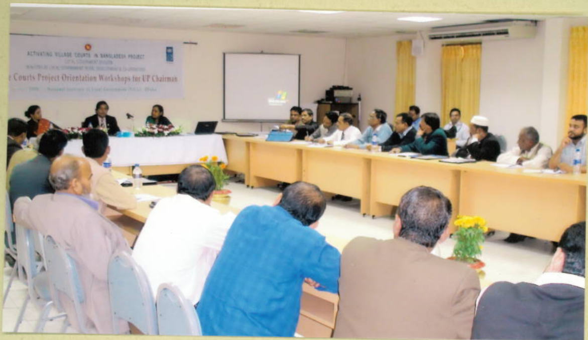
A view of orientation workshop on village courts with UP Chairmen