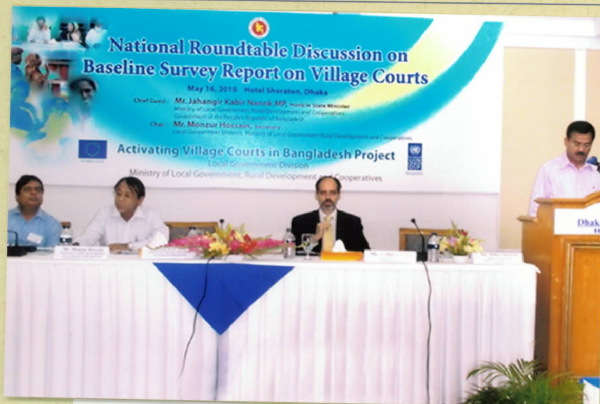
National Roundtable Discussion on Baseline Survey on Village Courts in Bangladesh