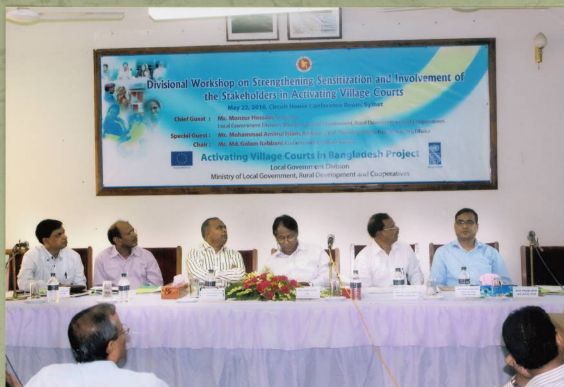
Awareness & involvement of stakeholders' workshop on village courts