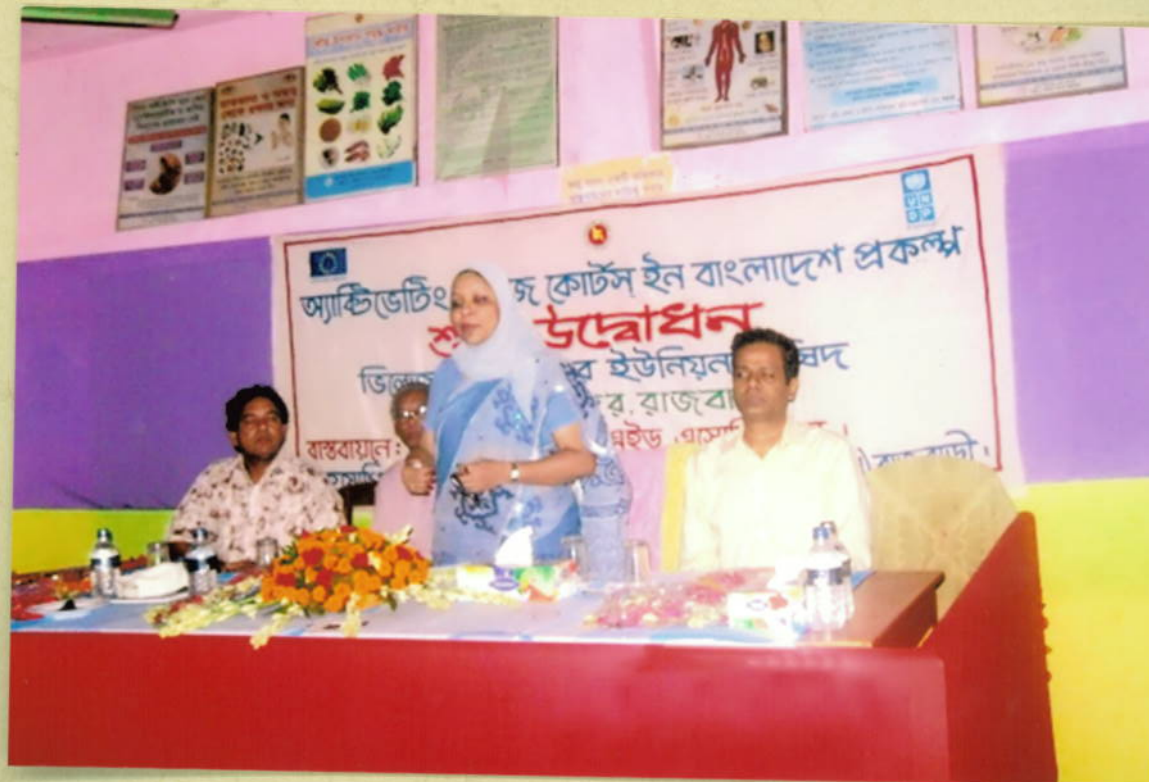
Inauguration of setting Ejlal for village courts by Deputy Commissioner, Rajbari