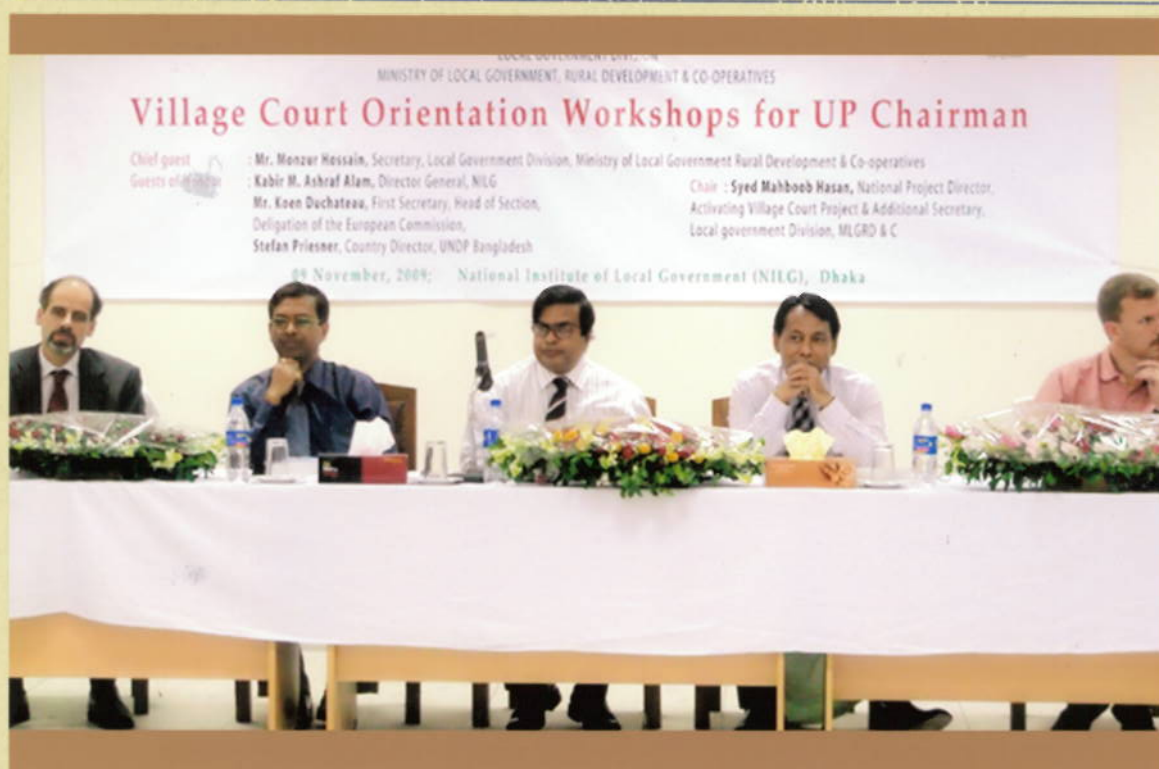
Orientation workshop on village courts with UP Chairmen