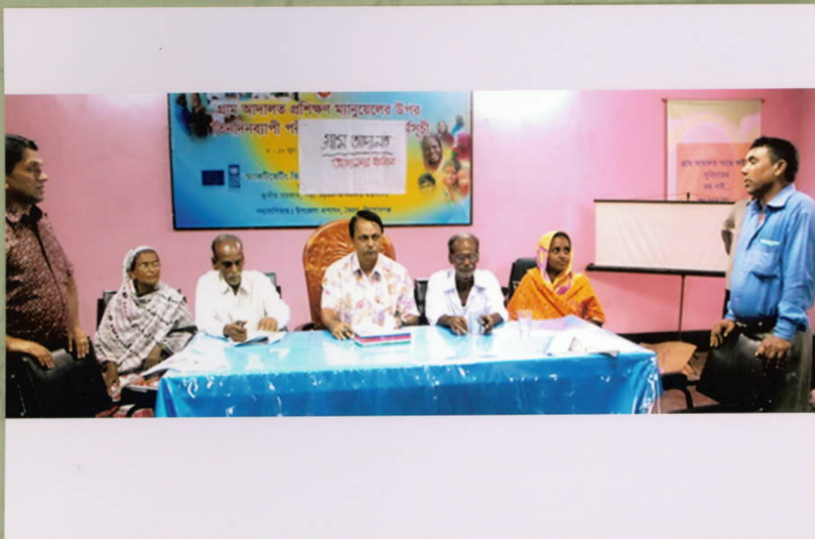
Simulation session on Village Court