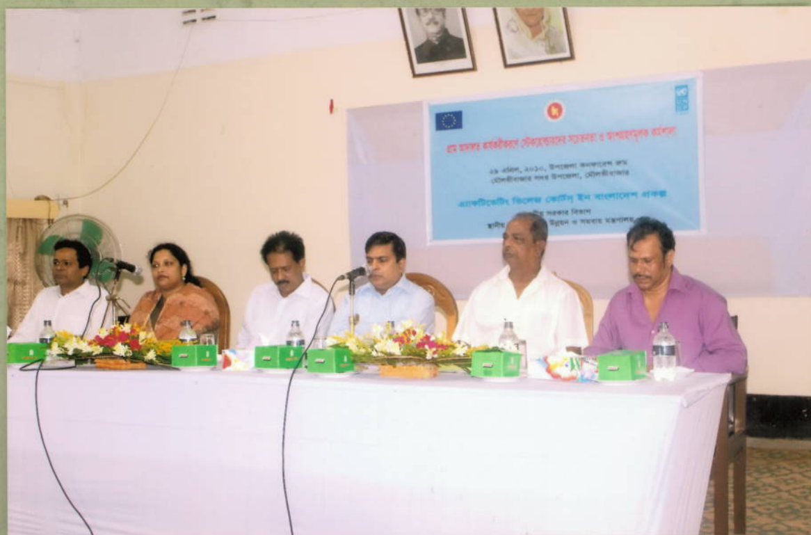
Awareness workshop on village courts