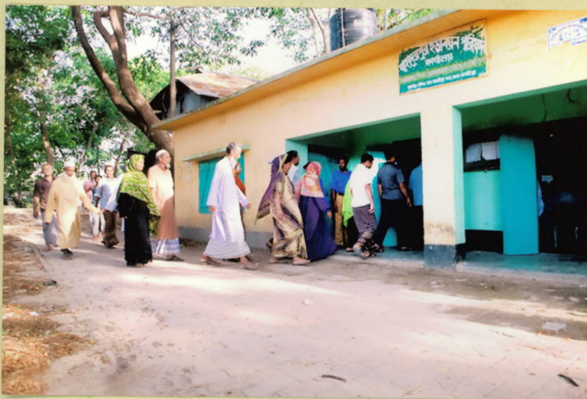
Villagers towards to village courts for justice