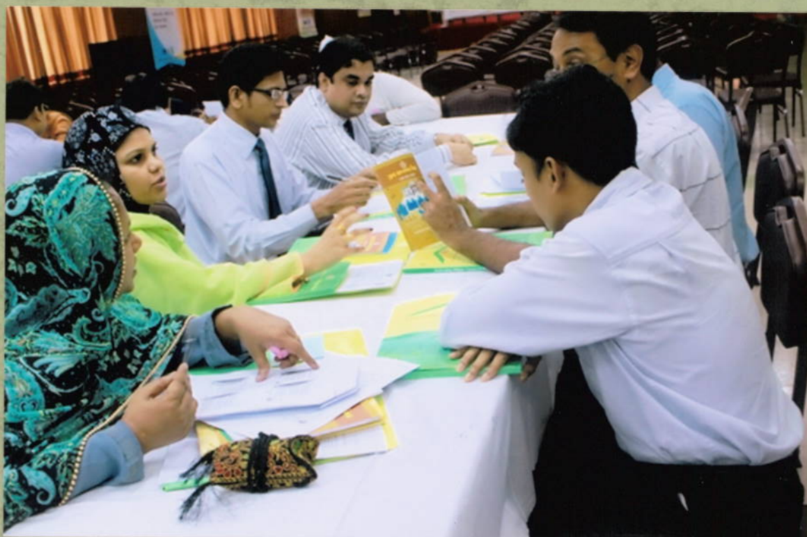
Participants are engaged in group work at VC workshop