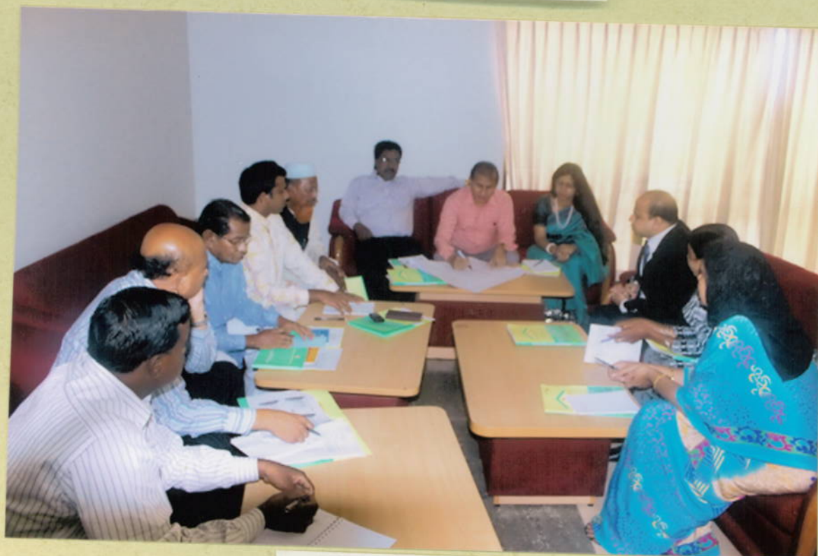
Group work in awareness workshop