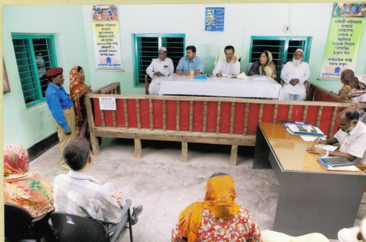
Village Court trial is going on