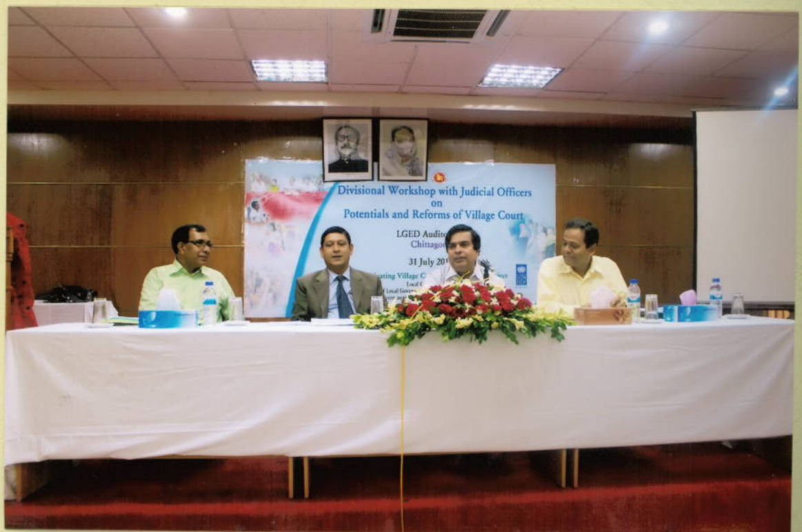
Workshop with judicial officers on village courts