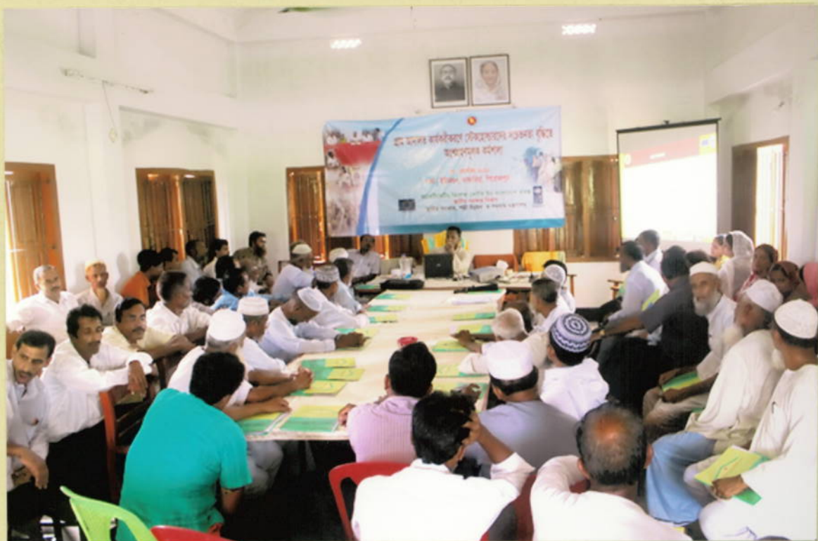
Awareness & involvement of stakeholders' workshop on village courts