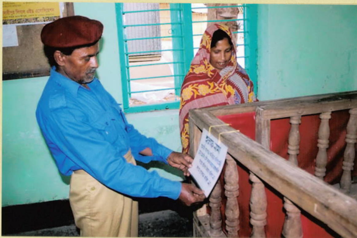
Conduction of oath taking by Gram Police