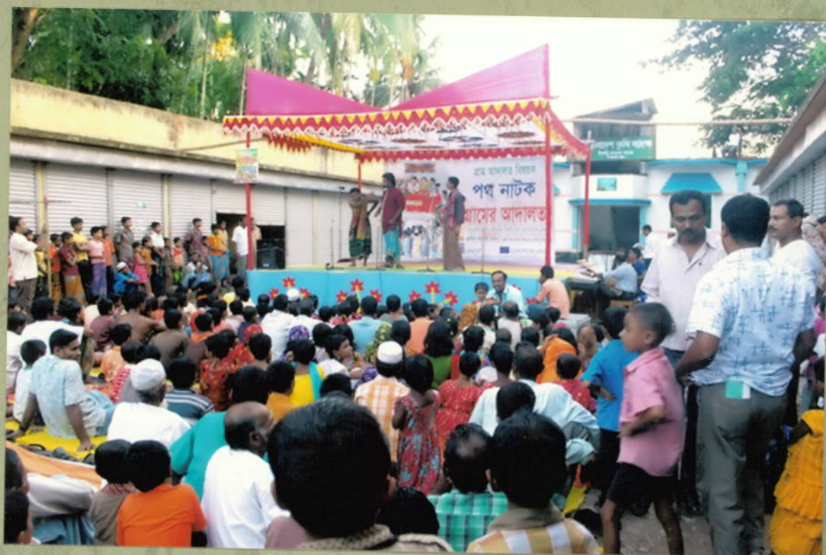
Street drama on village courts