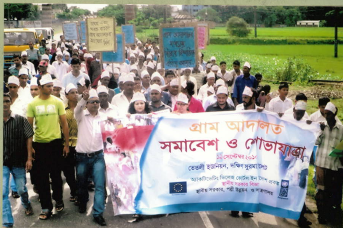
Rally on village courts