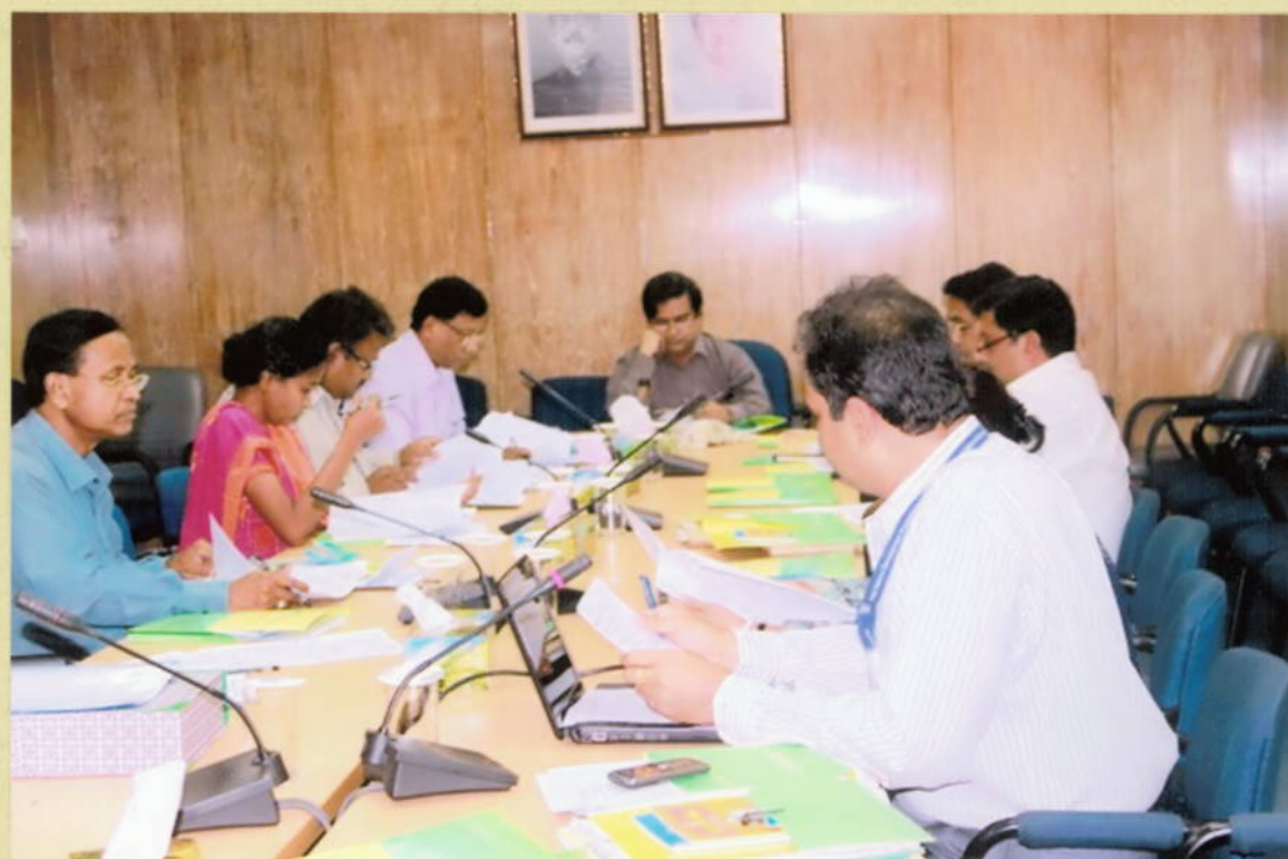
PIC meeting of Village Courts Project