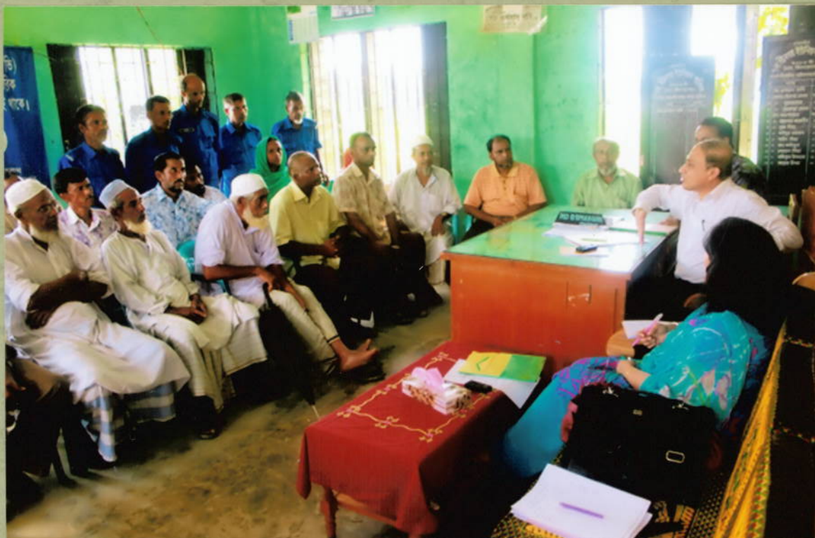
Stock taking visit and opinion sharing meeting regarding model VC at Bhairab, Kishorganj