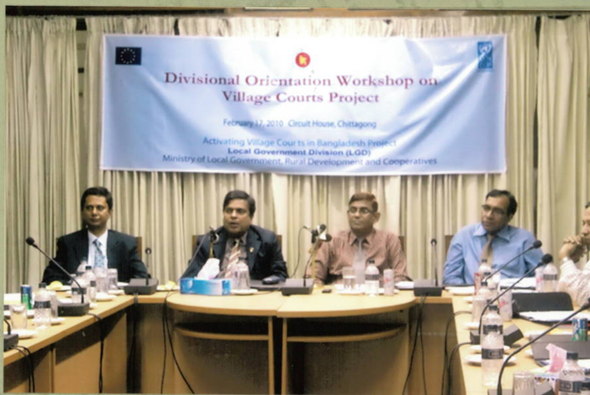
Divisional workshop at Chittagong