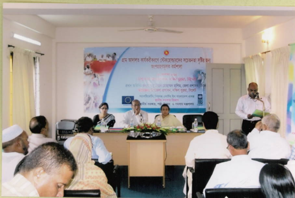
Awareness workshop on village courts