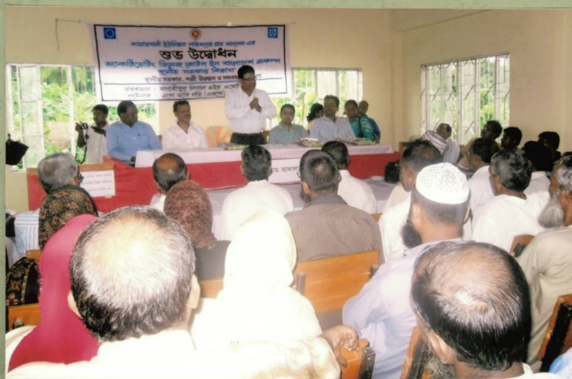
Inauguration of setting Ejlas for village courts by Deputy Commissioner, Faridpur