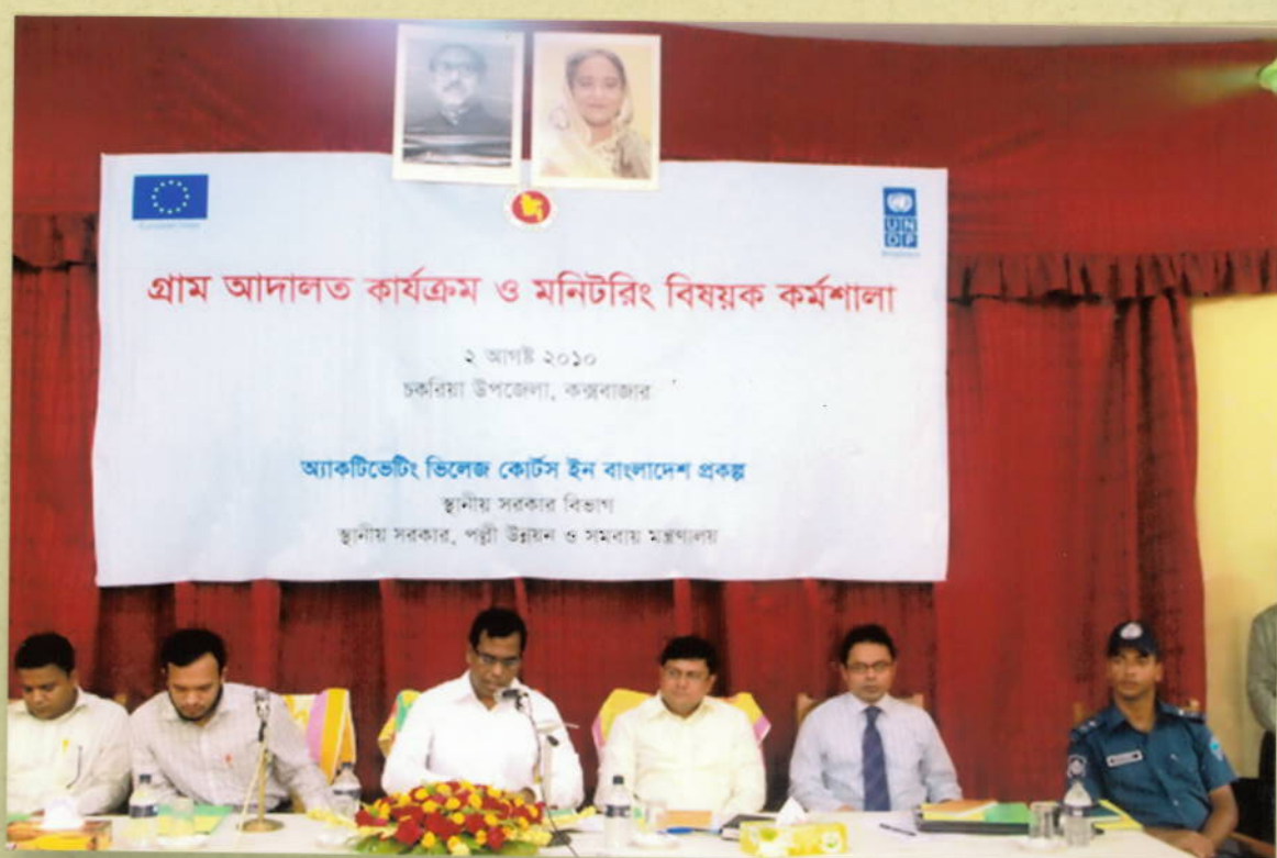
Monitoring workshop on village courts