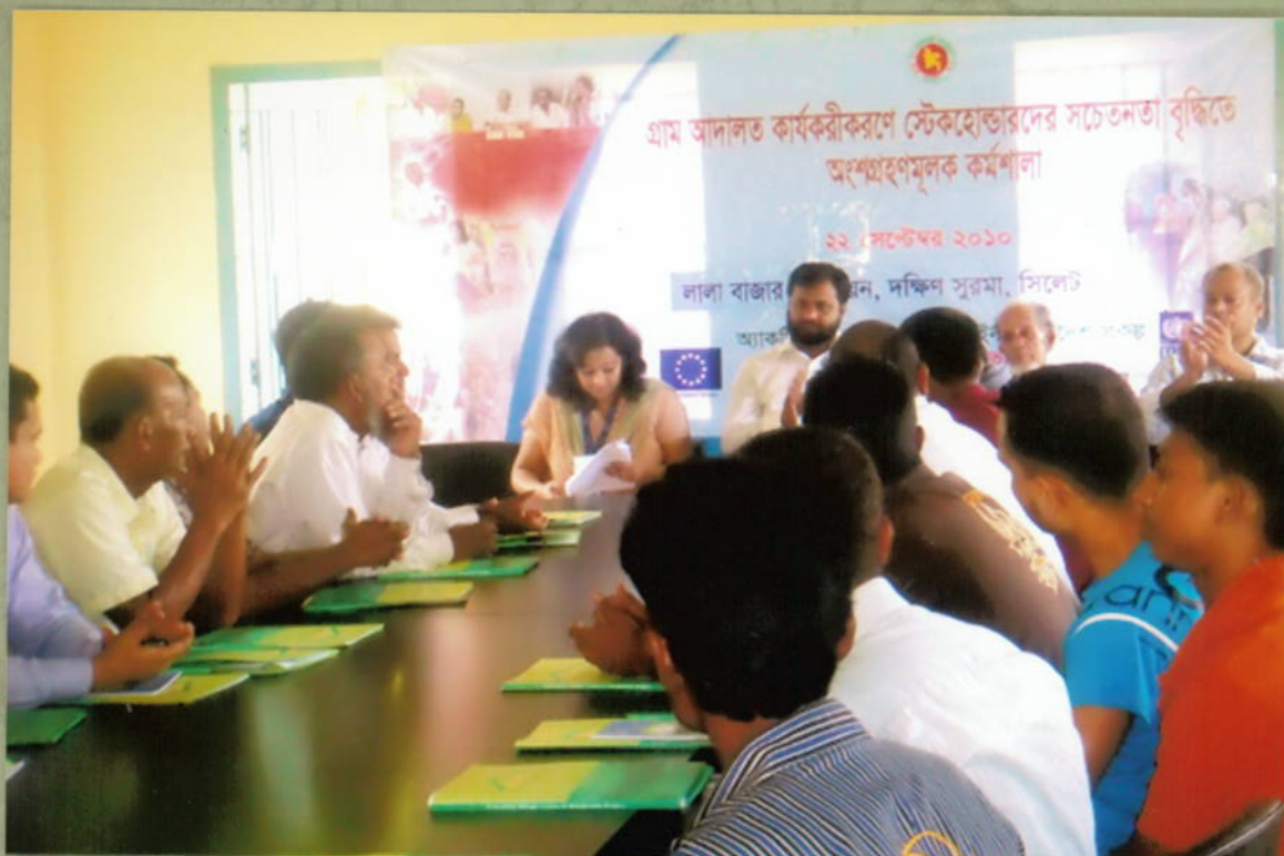
Awareness raising workshop on village courts