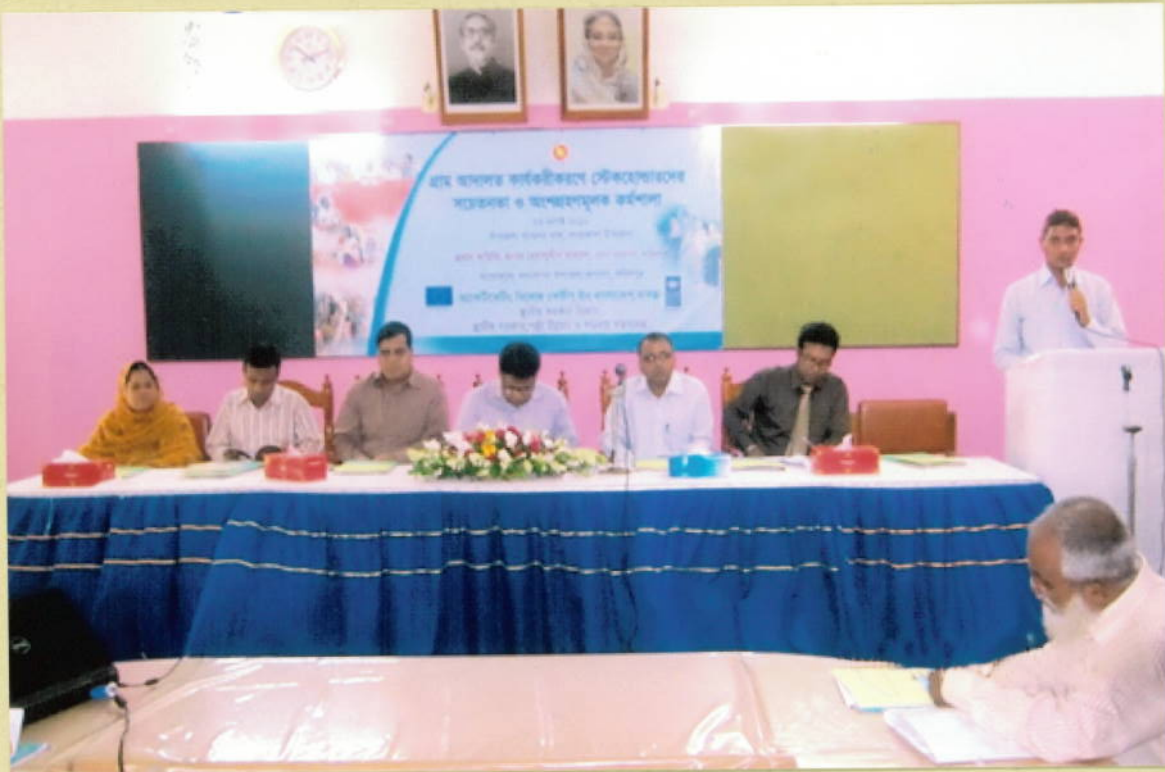
Awareness & involvement of stakeholders' workshop on village courts