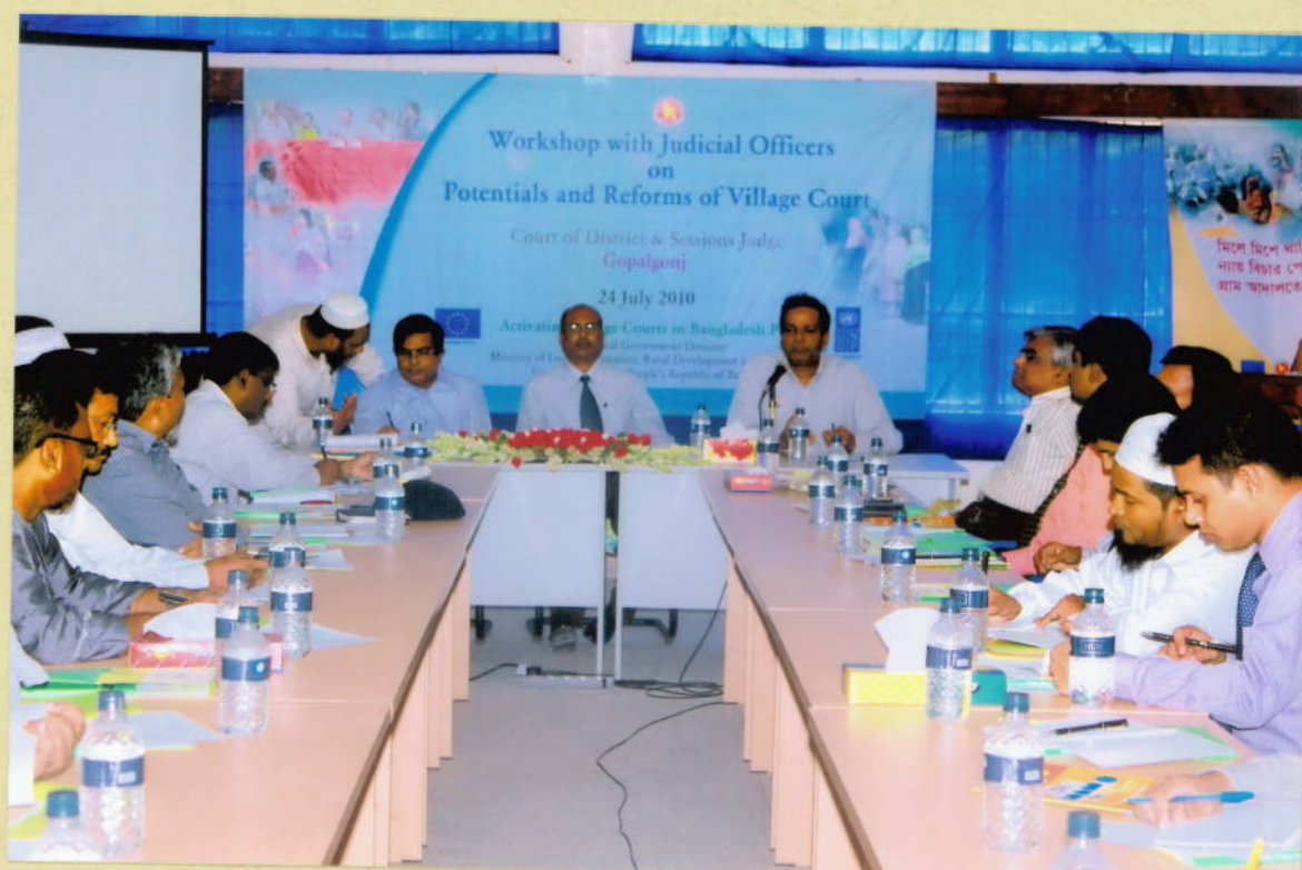
Awareness raising workshop on village courts