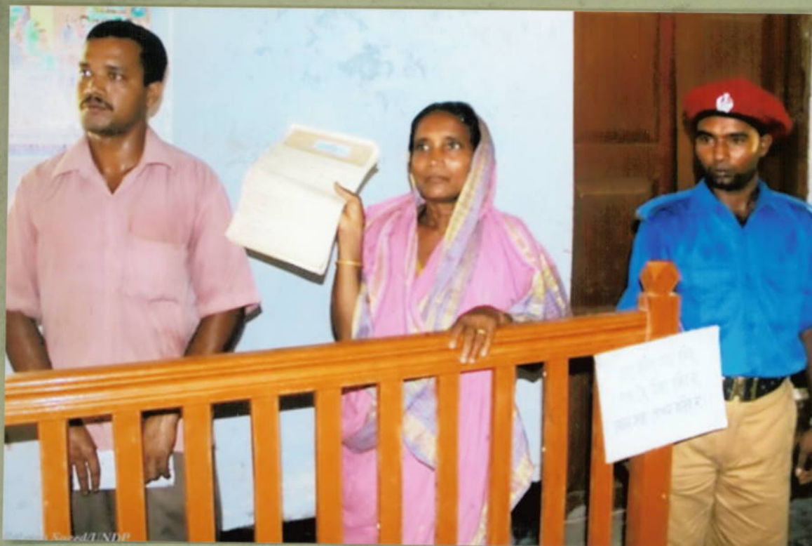
A part of trial of village courts