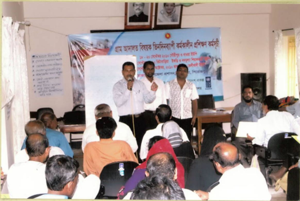
On the job training on village courts