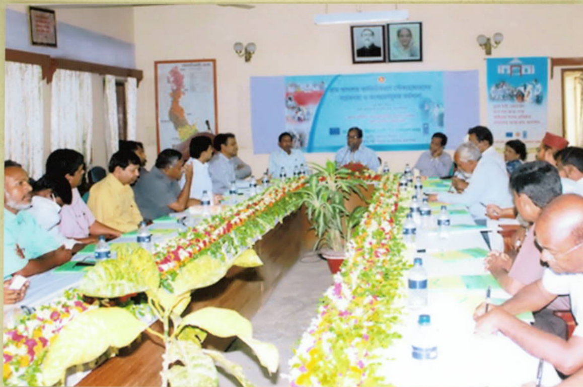
Awareness & involvement workshop on village courts