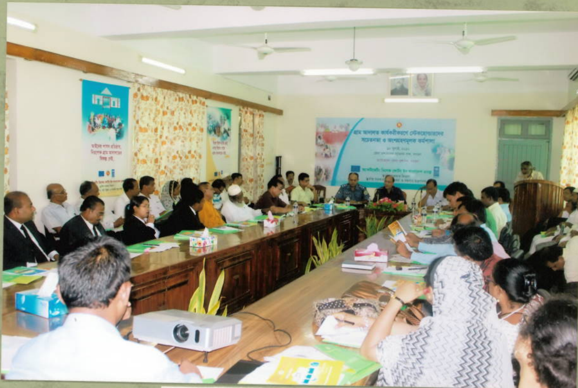
Awareness raising workshop on village courts