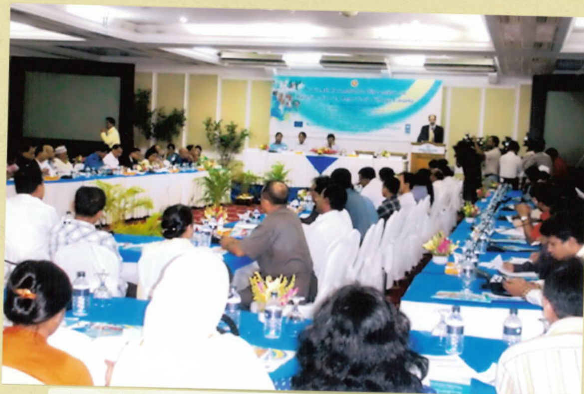
A view of National Roundtable Discussion on Baseline Survey on Village Courts in Bangladesh