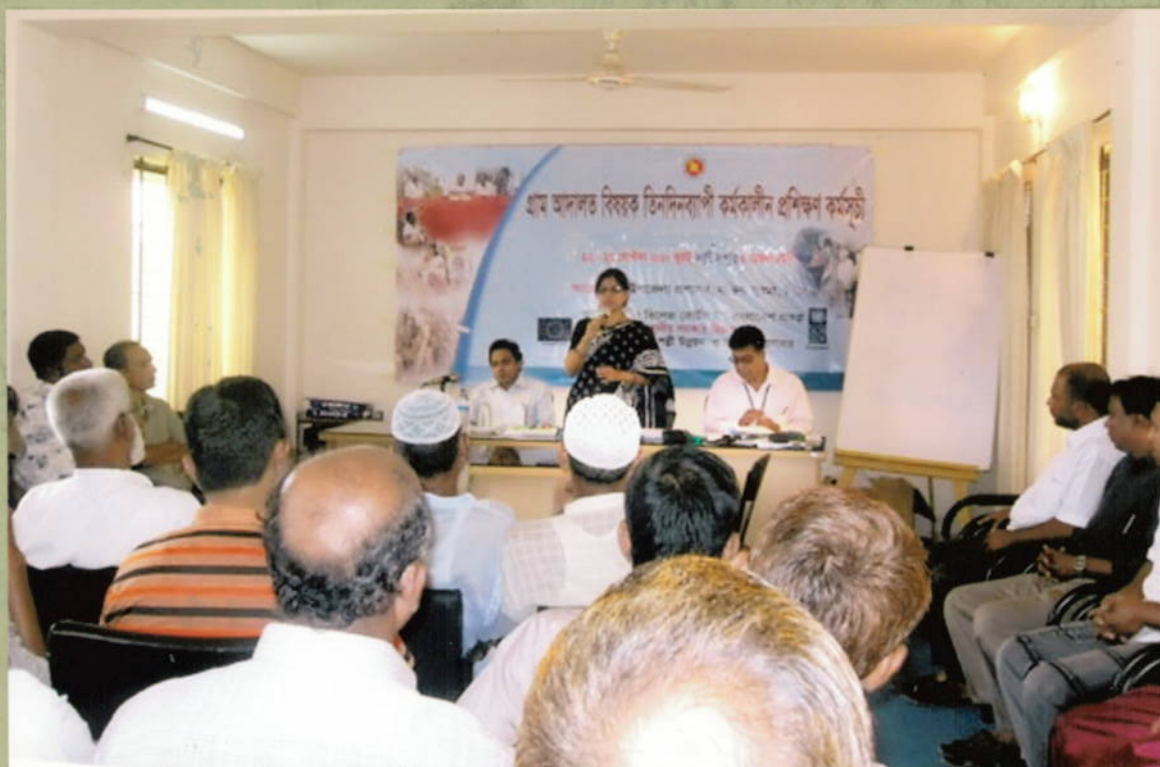
On the job training on village courts