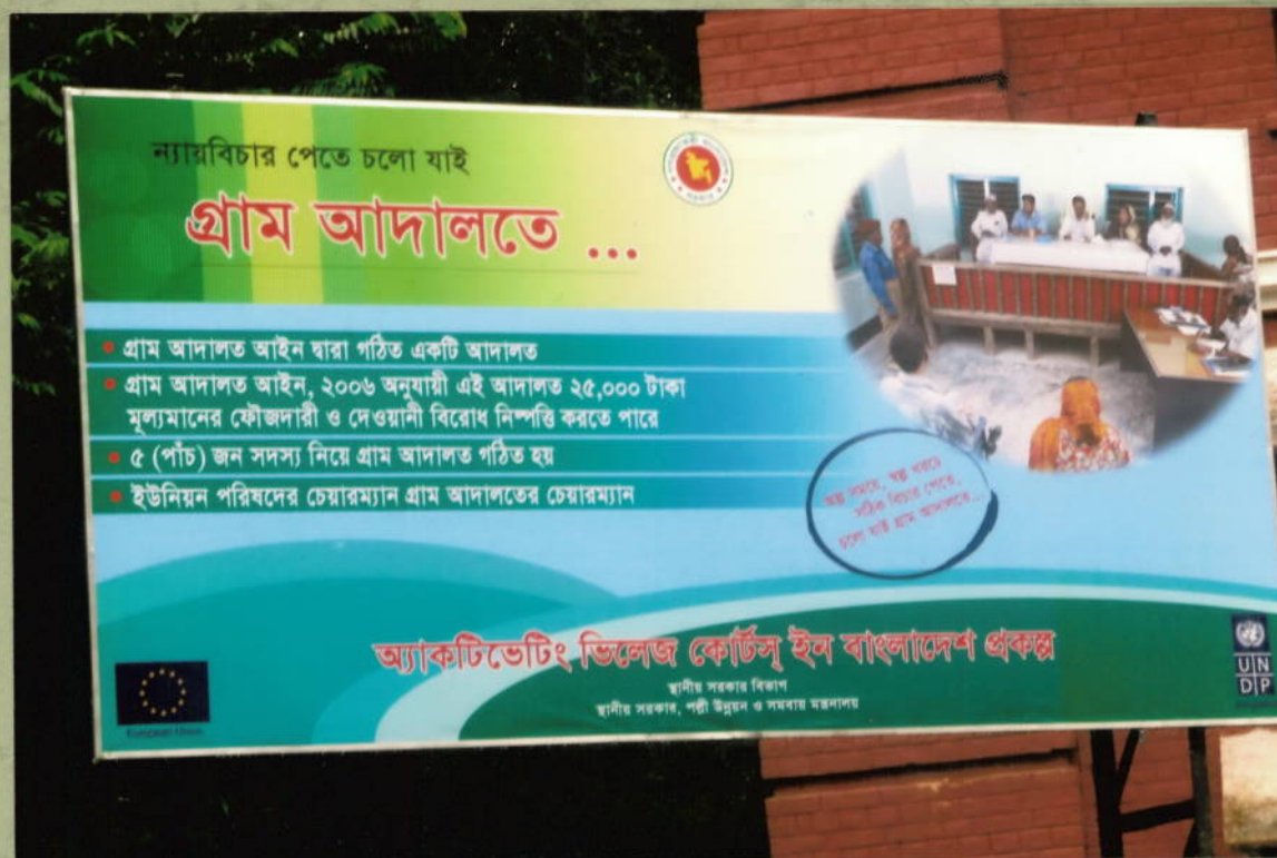
Village Court Billboard for boosting awareness