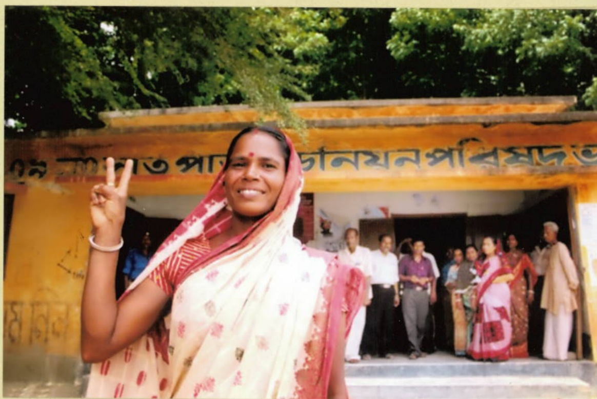
Smiles of having justice